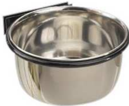
Pet Bowl.