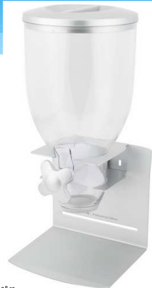
Dispensing Mechanism.